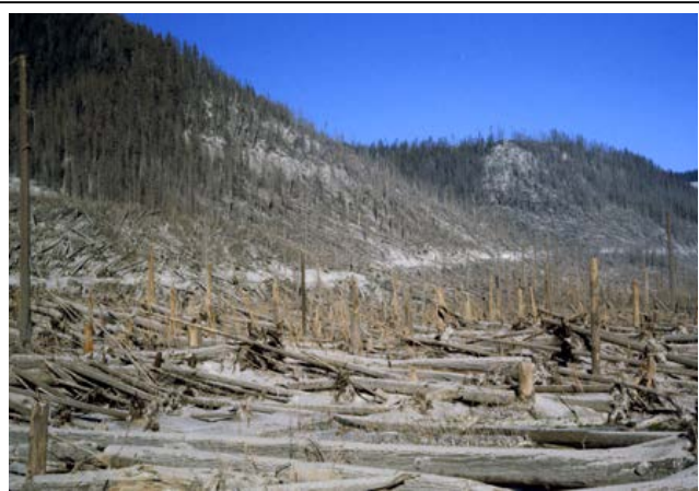
Fig. 2.5. Clearwater blown down zone: Fireweed dominates the immediate plant response to the blast in the (August 20, 1980).

During the summer of 2008, traffic along the FR-99 was blocked beyond Bear Creek Lookout by a landslide that collapsed half of the road for several hundred meters. Although the road was passable, the public was excluded by a locked gate. We had permission to enter, and that was a lonely summer. On our last trip, we were shocked to find a large tent pitched just off the road. Later that day, we met the location manager for a film crew shooting a movie. She said the movie was “a post-apocalyptic tale of a man and his son trying to survive by any means possible,” based on Cormac McCarthy’s novel. Her crew and star Viggo Mortensen were there, but they were just filming “atmosphere.” We went about our business. That evening, we were slowly driving up the narrow “Trail of Terror” (see Sidebar 8.1) when a guy flagged us down and asked us politely to find a turn out. Such things scarcely exist on this extension of FR-99, but, as if by magic, one appeared. As we waited, we were dumbfounded to see two (!) large boom trucks, lumbering slowly down towards the Pumice Plain. In places, they had less than 10 cm clearance. They must have made it back because I recognized a few landscapes in the movie. The young women in my group that year could talk of nothing except about seeing Viggo at the commissary tent. The young men, and me too, lamented that the co-star, Charlize Theron, was not there.