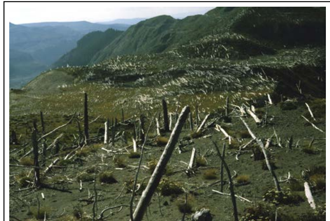
Fig. 2.10. Lower Toutle Ridge on the transition from blast zone to blown down zone. Site was on the west edge of the blast, but within 2 km of the crater. Conifers were young and flexible, so most resisted the blast, but their needles and branches were stripped. Snow cover was limited; so much of the understory was also removed (August 10, 1981).

blown-down zone. Litter (primarily dead leaves that fell during the summer) formed a protective barrier against rain and tephra deposits were thinner and conformed to