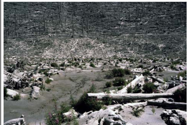
Fig. 2.4. Ryan Lake was devastated by the blast: Top. Surrounded by toppled trees and dense covering of tephra (July 8, 1980); Bottom. Scattered forbs are pushing through the ash, aided by summer rains. Note the elk tracks in mud (August 20, 1980).

could persist for several years. Dead standing snags persist in many places to the present although many have since fallen (Fig. 2.3). This landscape can be eerie, so much so that it was used in the 2009 film The Road , a story set in a “post-apocalyptic” America (see Sidebar 2.1).