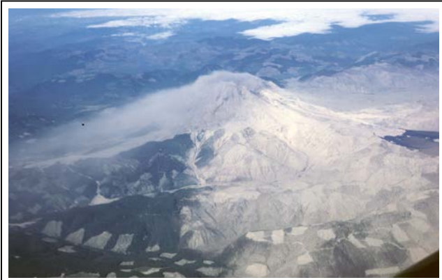
Fig. 2.1. Aerial view of the blast zone, showing the 170° arc of the blast. Scorch and blown-down forests can be seen in the foreground. Abundant clear-cuts and the Muddy River Lahar are also prominent (July 30, 1980, from a commercial airplane).

forces create massive swaths of jumbled forest remnants. For example, hurricanes devastate coastal areas, flattening forests, leaving behind impenetrable thickets. While damage decreases from the coast, it increases with the stature of the forest. Stems are broken and trees are uprooted. Topography can protect parts of the forest, to form a mosaic of damage. Hurricane Katrina (2005) killed 320 million trees along 5 million coastal acres. The decaying forest pumped as much carbon into the air as was absorbed by all U.S. forests that year. Forests can recover from hurricanes in many ways, including crown sprouting, so that the secondary succession is relatively rapid.