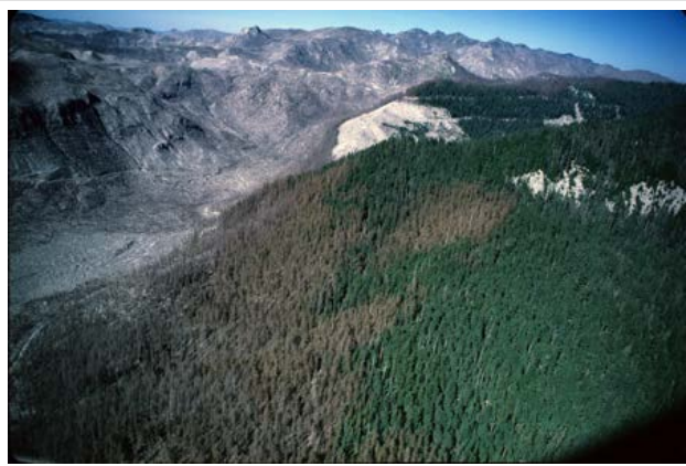
Fig. 2.2. Scorch zone, demonstrating the characteristic russet color of dead conifer needles (September 8, 1980).

are crucial to forest community recovery, for example as dispersal agents and by churning up soil. Birds and some mammals import seeds of species destroyed by the event.