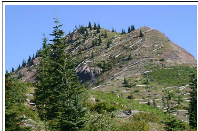
Fig. 2.7. Near Norway Pass, the forest is in recovery; downed trees provide erosion control and habitat for a variety of plants, mammals, birds and insects (August 16, 2011).

Today, the standing dead forest is starting to topple as supporting roots rot and can no longer support the boles. However, downed trees of the blown-down zone still remain visible but somewhat obscured by understory vegetation and soil development. They are gradually being buried by soil build up, by compression from winter snow