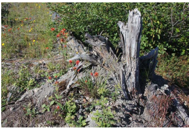
Fig. 2.13. Nurse effects from destroyed trees have lasted decades. Here, on an exposed ridge, the remnant of a subalpine fir provides protection, enhance fertility and greater moisture for invading species that include slide alder, paintbrush, wood rush, waterleaf and various grasses.