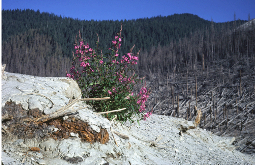
Surviving fireweed emerges from blast and tephra near Ryan Lake (August 20, 1980).