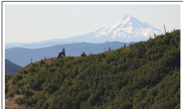
Fig. 2.9. Rapid recovery of saplings and understory vegetation was common on protected, north facing slopes such as this slope above Bean Creek (August 16, 2011).

The general pattern of recovery in the blown-down and seared areas was evident in the earliest studies (e.g., McGee et al. 1987). Understory cover was about 3% where a snow pack had existed during the eruption and barely measurable in sites on warmer slopes and at lower elevations. Typically, plots had eight species compared to two in snow-free sites. Recovery was more rapid at increasing distances from the crater where tephra deposits