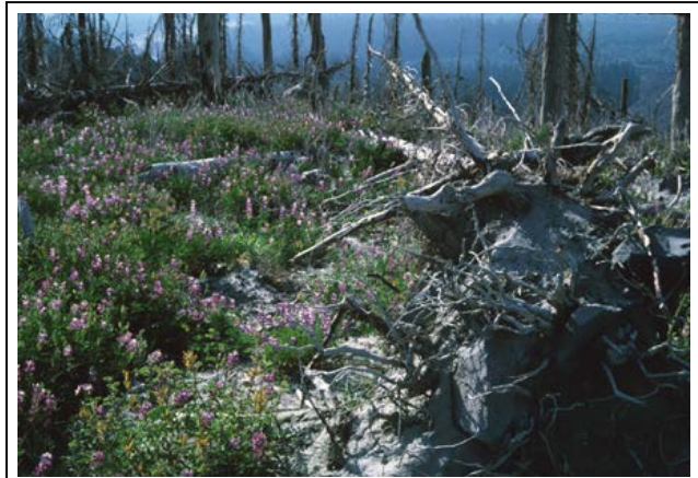
Fig. 2.6. Near the eastern boundary of the blast, on Pine Creek Ridge, trees were killed, but the understory of Cascade lupine, bear grass and sedges recovered quickly (August 12, 1981).

The distance from the crater to the edge of the blown-down zone varied with topography. The force of the blast was attenuated to the east and west of the main direction of the blast. Thus, on Pine Creek Ridge, on the eastern blast boundary, trees died, but remained standing, and the snow protected a lush understory. In August 1981, Cascade lupines and bear grass formed a dense understory that protected the slopes from further erosion (Fig. 2.6).