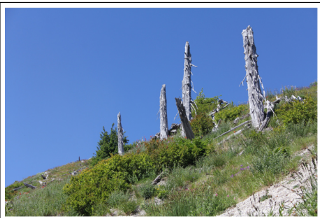
Fig. 2.8. Exposed sites remain dry much of the summer, stunting recovery (August 17, 2011).

South facing slopes in this region are generally expected to recover from disturbances more slowly than north facing ones due to greater drought and exposure to wind. On Mount St. Helens, they were also fully exposed to the blast and had the least snow to protect the ground layer vegetation. These sites remain impoverished (Fig.