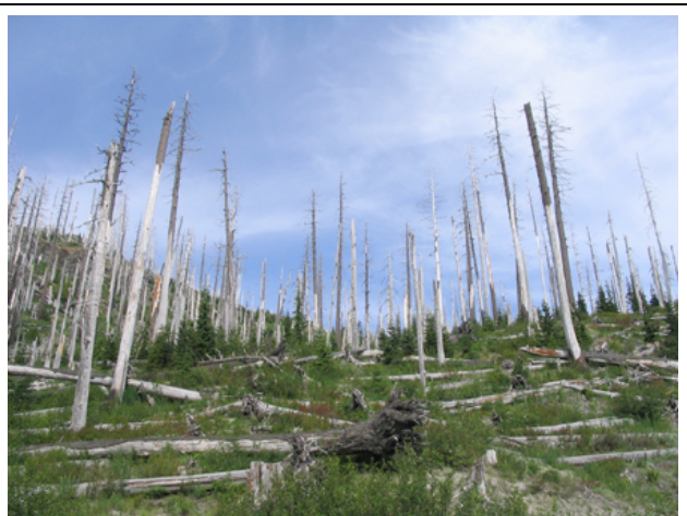
Fig. 2.3. Standing dead zone along FR-99. A. Standing dead and toppled trees with slide alder and grasses (July 30, 2004); B. After 31 years, many stems have toppled as the standing dead zone is being transformed into a zone where the fallen stems are gradually incorporated into the soil (August 15, 2011).

The blast zone has three regions. Within 10 km of the crater, most vestiges of vegetation were removed (tree removal zone; see Chapter 4). More distant, trees were killed, but snow protected understory vegetation in localized patches. This outer part of the blast zone includes two regions dominated by forest remains: the blown-